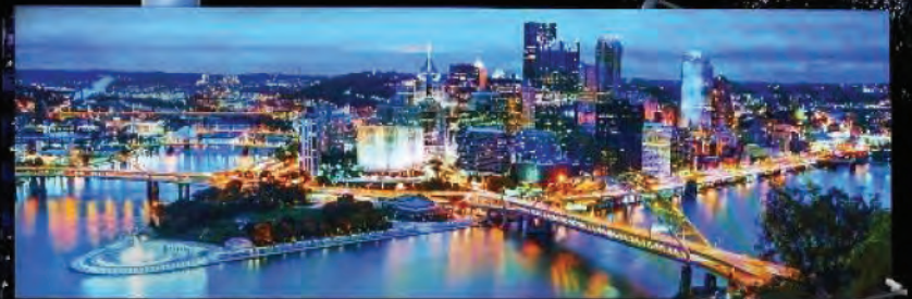
ORANGE BARREL MEDIA

Avoid pastel colors from the center rings